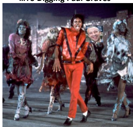
1.4% Whabouchi Spodumene Rocks! New Nemaska is aLivent!